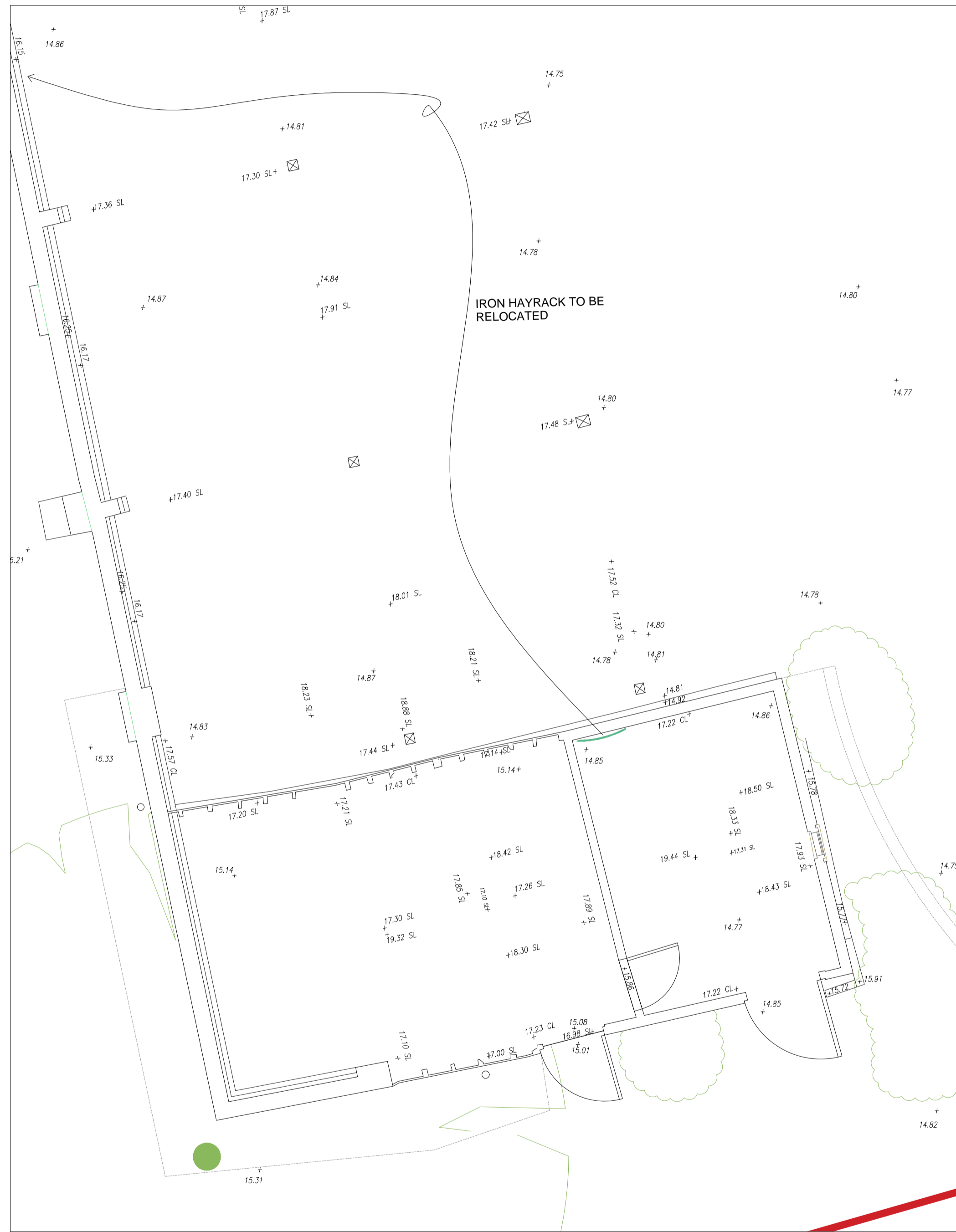
Existing Floor Plan - Stables 1:50